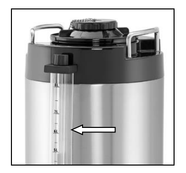
√ Filling level display