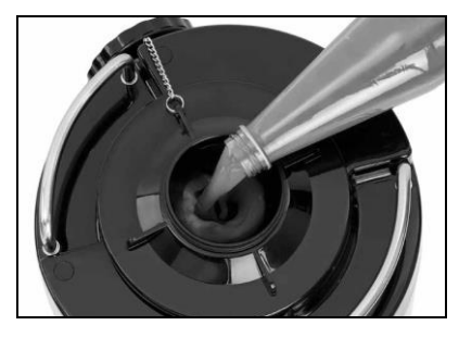
✓ Split lid: detachable for cleaning, twist-out lid lock for dispensing