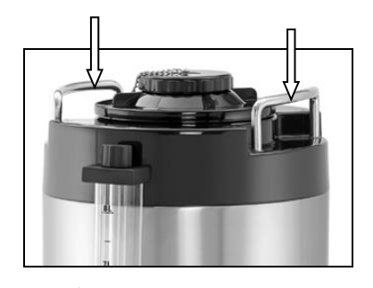
✓ Carrying handle (2x)