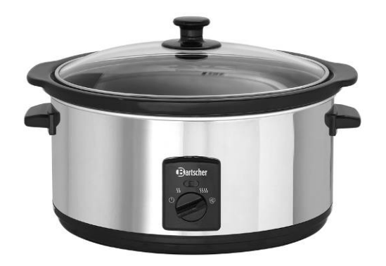
A100265 / 6,5L