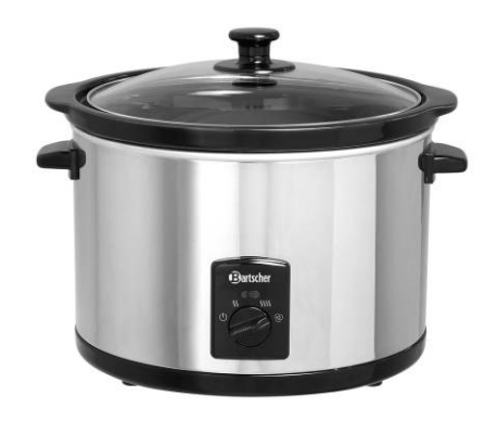
A100155 / 5,5L